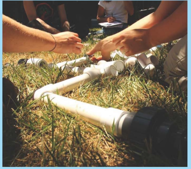
Thursdays in October from 6-7:30pm 1.Graywater basics: Oct. 14th 2.Laundry-to-Landscape: Oct. 21st 3.Permitted Graywater Systems: Oct. 28th